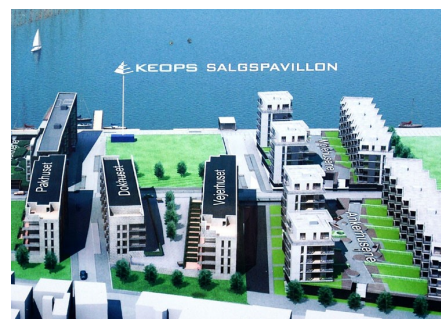
The architect's model shows how the newly designed district at the harbour should look like.

the system build-up Roof Garden using Floradrain® FD 40-E elements to ensure water storage and unhindered drainage. The private gardens which belong to the apartments in the basement are hidden behind a hedge. Furthermore there are walkways and extensive green roofs under which the shallow the Drainage Mat DBV 12 or Floradrain® FD 25-E elements were used as a drainage element. From the slightly curved public path you can see and smell a colourful interplay of drought resistant plants.