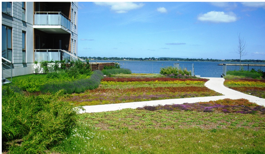
According to the development plan the view to the sea was not blocked.