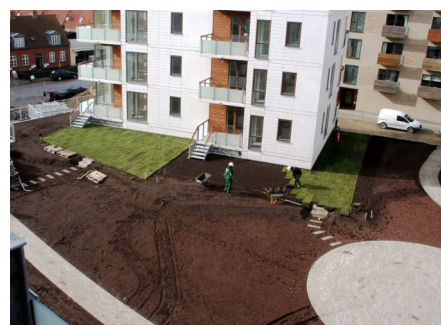
After completion of the rough works on the underground garage roof, the turf in the private gardens was laid.

Plant layer according to Plant list System Substrate Filter Sheet SF Floradrain® FD 40-E Protection Mat SSM 45 Roof construction with root resistant waterproofing