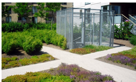
Only the stairway suggests that there is a parking garage under the garden.