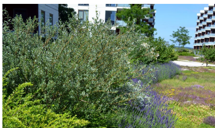
Perennial plants such as Lavender set visual accents as a framework.